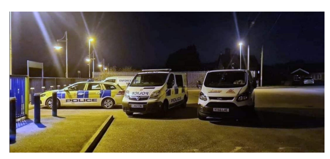
Multi-agency ASB patrols