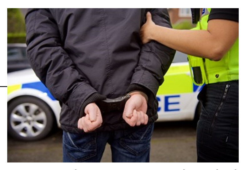
Wanted Person apprehended